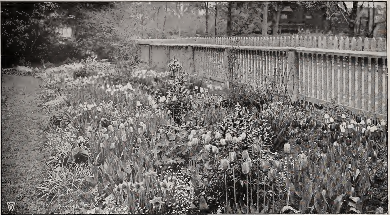
A hardy border illustrating the use of Darwin Tulips, planted in clumps throughout